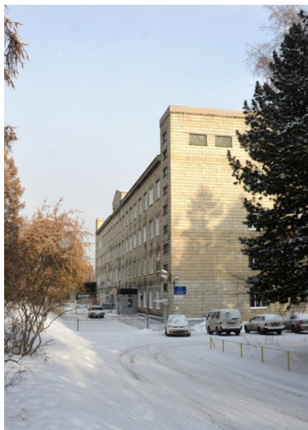
A.P. Vinogradov Institute of Geochemistry SB RAS, founded 1957/11/29